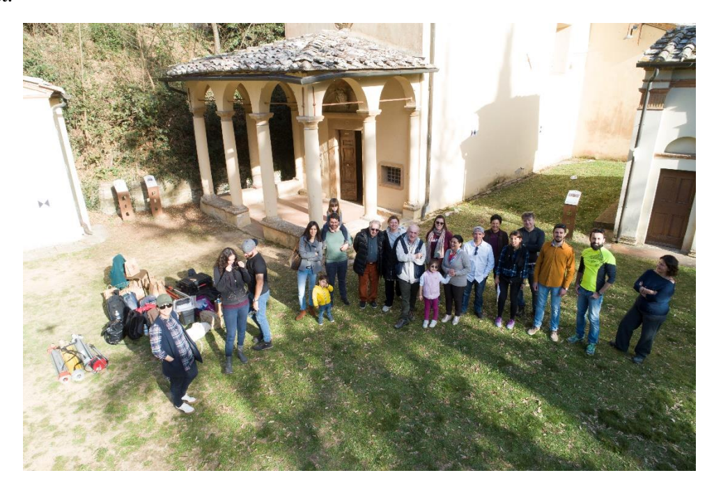
An aerial image of the participants from Cuba, Italy and Greece at the S. Vivaldo workshop

The didactic paradigm of Dehradun's tutorial was tested again in a workshop held from 23 to 26 March 2019, acquiring part of the so-called New Jerusalem of San Vivaldo, (Montaione, Italy). In this case the participants, coming from Cuba and Greece, were already trained on laser scanning and photogrammetry and the workshop aimed to improve their practical skills. With regard to the didactic materials, this was another test to assess their clarity and effectiveness in front of an audience with already acquired skills. During the workshop, data acquisitions and processing were carried out.