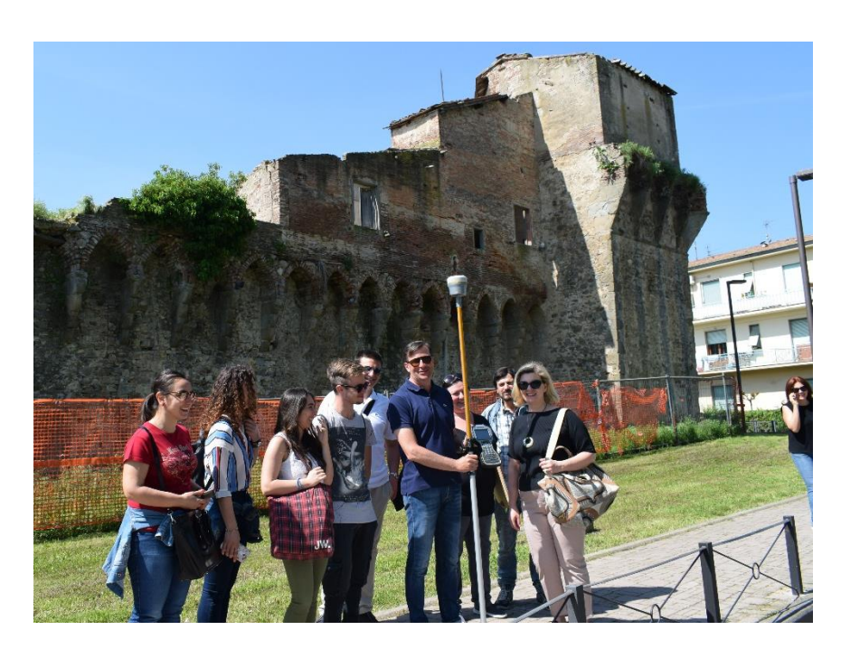
Some of the students of the University courses during the GNNS acquisitions in Lastra a Signa

Moreover, students have been requested to make short videos for illustrating the acquisition of photogrammetric data and their process as a feedback for understanding which aspects they considered more challenging and significant.