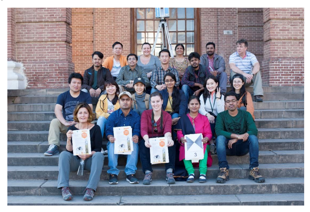
The participants of the pre-symposium tutorial Ground based 3D Modeling (Close Range Photogrammetry & TLS) in Dehradun, India

comparing the results. The field experience was focused to document the facades of the central court, with a special attention to the left wing, where the vaulted portico at the ground floor has been surveyed.